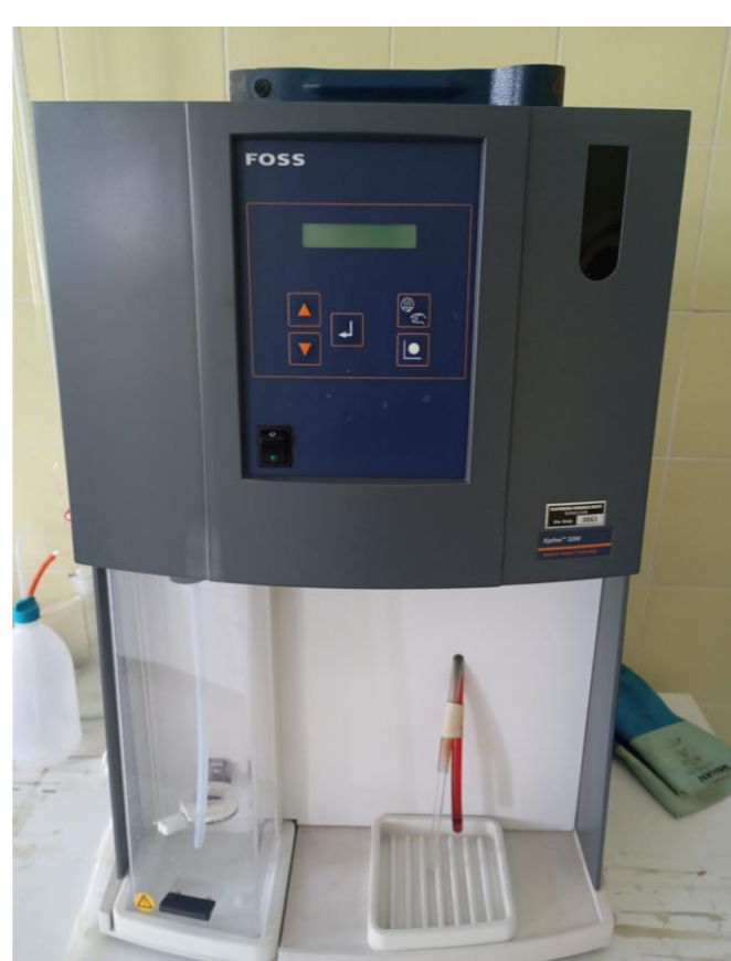
Figure 5. Nitrogen content determination