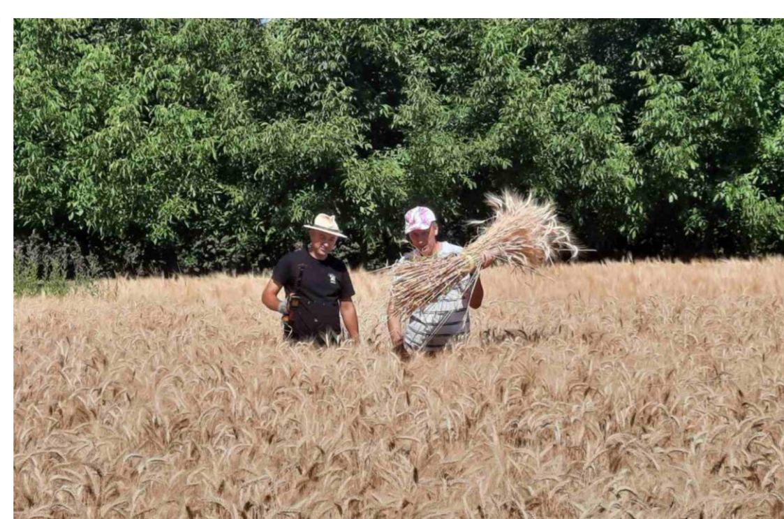
Figure 2. Triticale sample collection