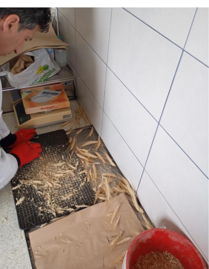
Figure 3 and 4. Cleaning of the sample